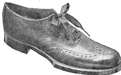
Men's Double Sole Calf Skin Oxford Ties.

THE NEW HAVEN SHOE COMPANY 842 and 846 Chapel St.