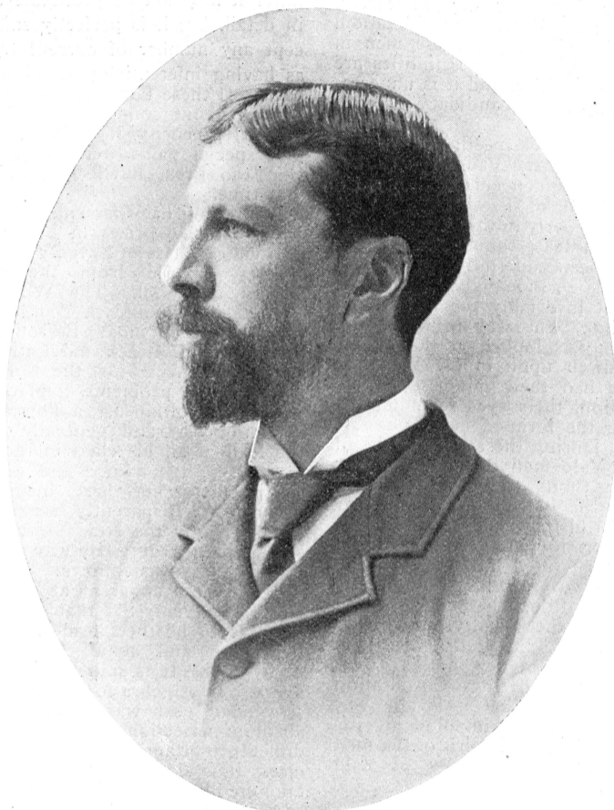
CHOSEN AS SUCCESSOR TO TIMOTHY DWIGHT AT THE MEETING OF THE YALE CORPORATION, MAY 25, 1899.