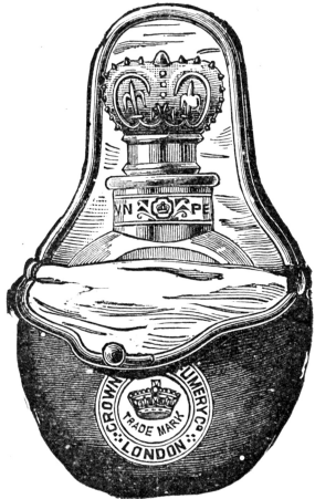
Crown Perfumed Pocket Salts.

THE CROWN PERFUMERY CO., Of London, call attention to one of their most charming novelties.