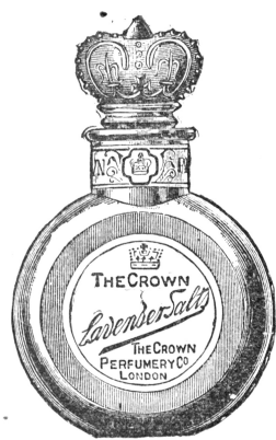
Crown Lavender Pocket Salts.

For sample policies, terms, etc., address the Home Office.