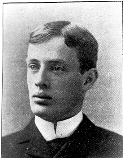
PROFESSOR OLIVER H. RICHARDSON.