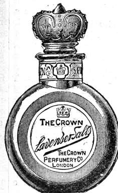
Crown Lavender Pocket Salts.

THE CROWN PERFUMERY CO., Of London, call attention to one of their most charming novelties.