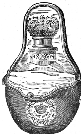
Crown Perfumed Pocket Salts.